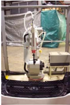
Robot Work Cell