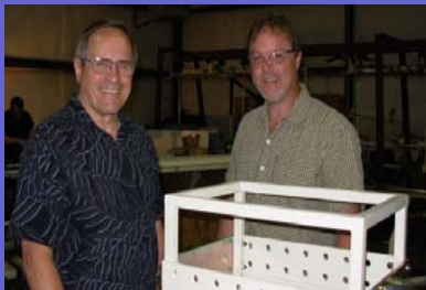
Our team is friendly and dedicated to supporting our customers